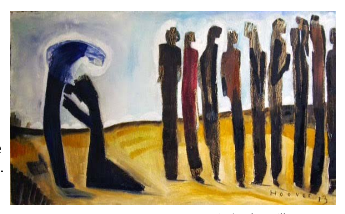
Painting by: Bill Hoover

* Indicates please stand in body or spirit.